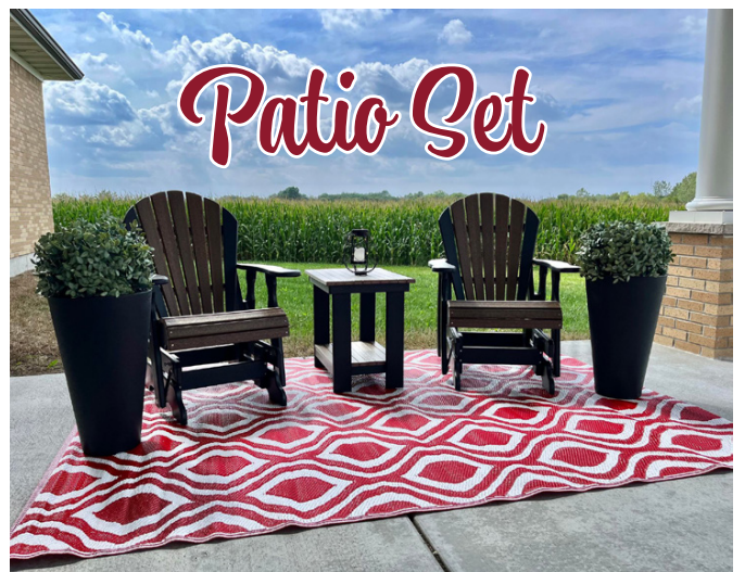
Two gliders with side table, outdoor rug, two planters with artificial plants and solar lantern.

Proceeds go to benefit the Home Care & Hospice Foundation of Pike County.