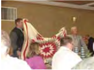
A quilt being auctioned off at the Spring Bash.

The Spring Bash was held March 20th at the Pike County Fairgrounds. The event was a huge success raising over $27,000! The night included supper, silent auction, live auction and raffle items. There were approximately 300 people in attendance.