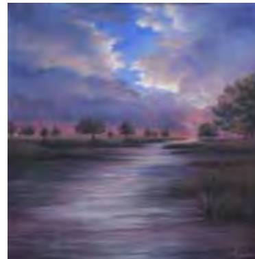
Memorial Service theme “The River”

Hospice volunteers perform many services for the hospice patients and families in our community, such as companionship, respite for caregivers, clerical duties, preparing meals for hospice patients and their families, run errands, supply delivery and pickup, serving as board members and assisting with various hospice activities.