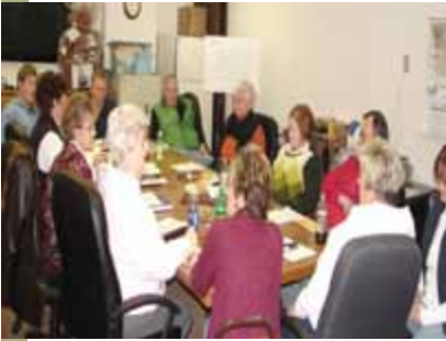
Foundation Board hard at work.