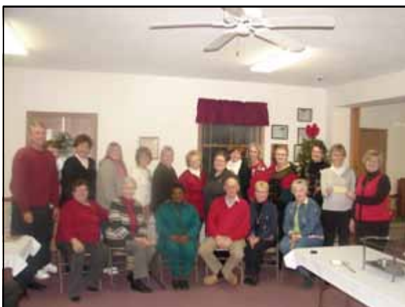
Hospice Volunteers present a $5000 check to the Building Fund.