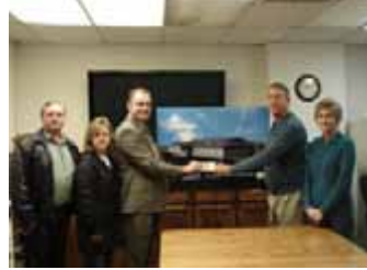
Ashley Pentecostal Church making the first contribution and creating the Church Challenge.